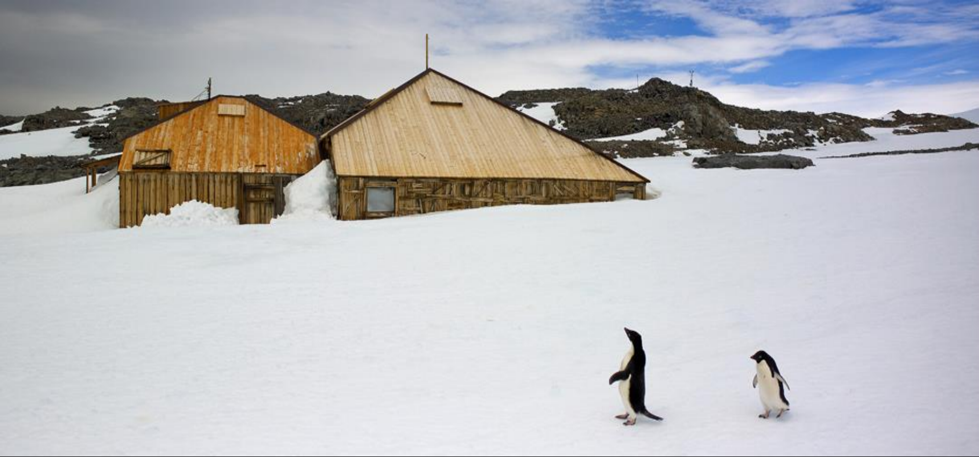
AUSTRALIA'S ANTARCTICA MAWSONS HUT