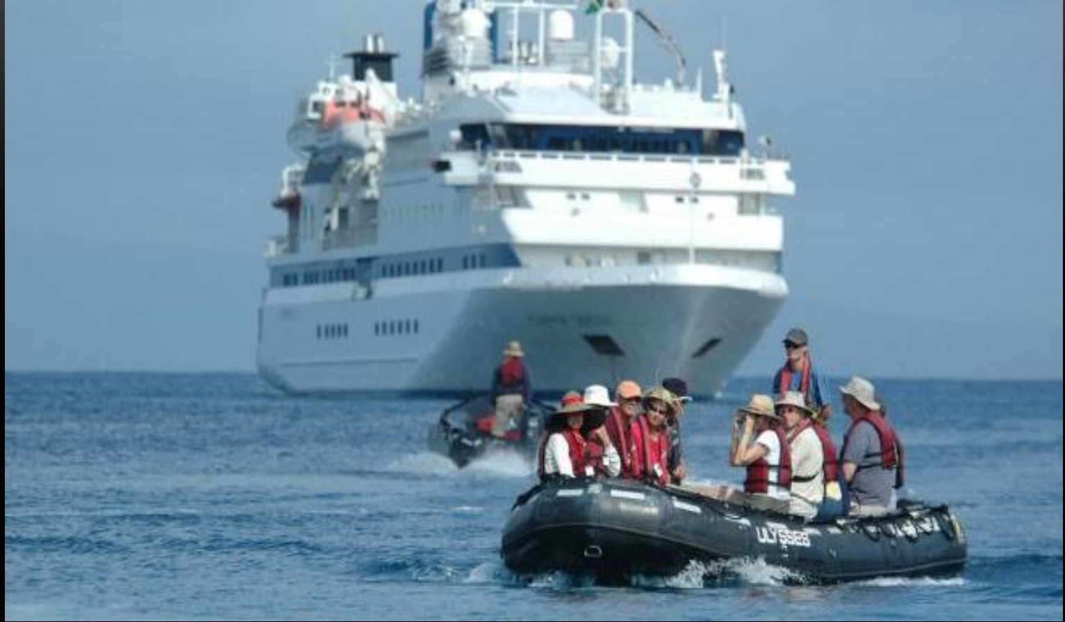
CLIPPER ODYSSEY - to become Silver Discoverer March 2014