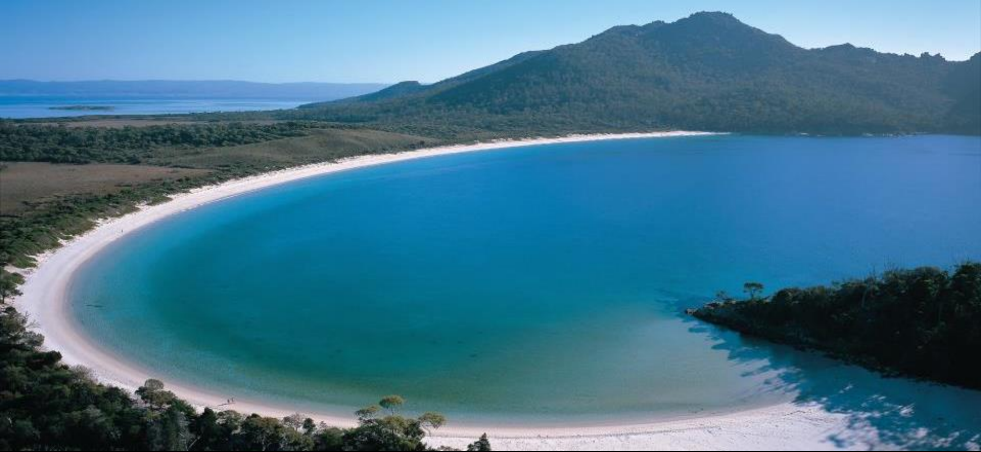
WINE GLASS BAY