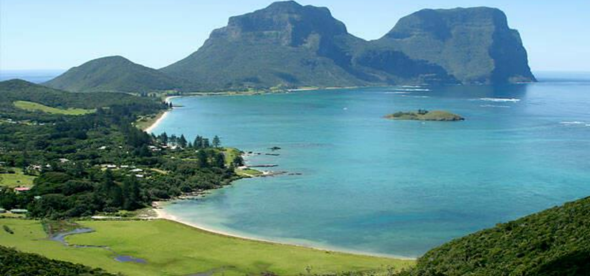
LORD HOWE ISLAND