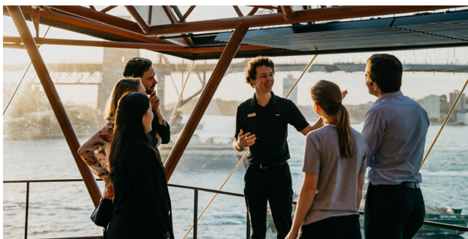
Sydney Opera House

The Sydney Opera House offers a range of tours which bring to life stories of the iconic building's past and present. The one-hour tour is perfect for those with limited time in port and is suitable for groups of all sizes from small groups to whole-ship touring. Our backstage tour,