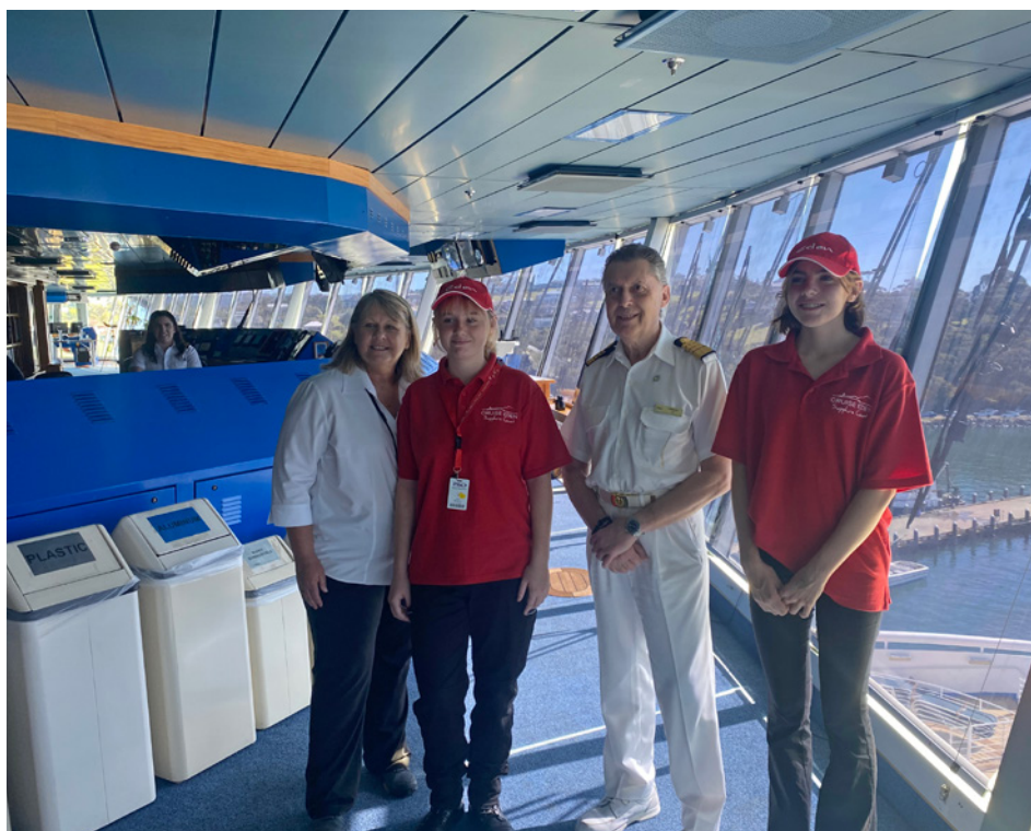
Students receiving a warm reception from the bridge