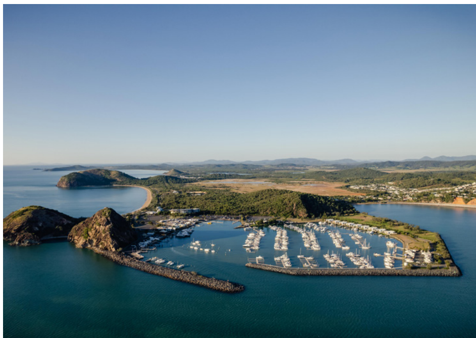
Keppel Bay Marina/Rosslyn Bay Harbour - Yeppoon/Capricorn Coast

Wop-pa Great Keppel Island, means 'resting place' and is the perfect location to do exactly that – drop and flop. However, if you are looking for more adventure, to reconnect with nature, or revitalise your soul with magical underwater discoveries, Great Keppel Island is a one-stop holiday destination that wraps up iconic quintessential Aussie experiences and ticks plenty of boxes.