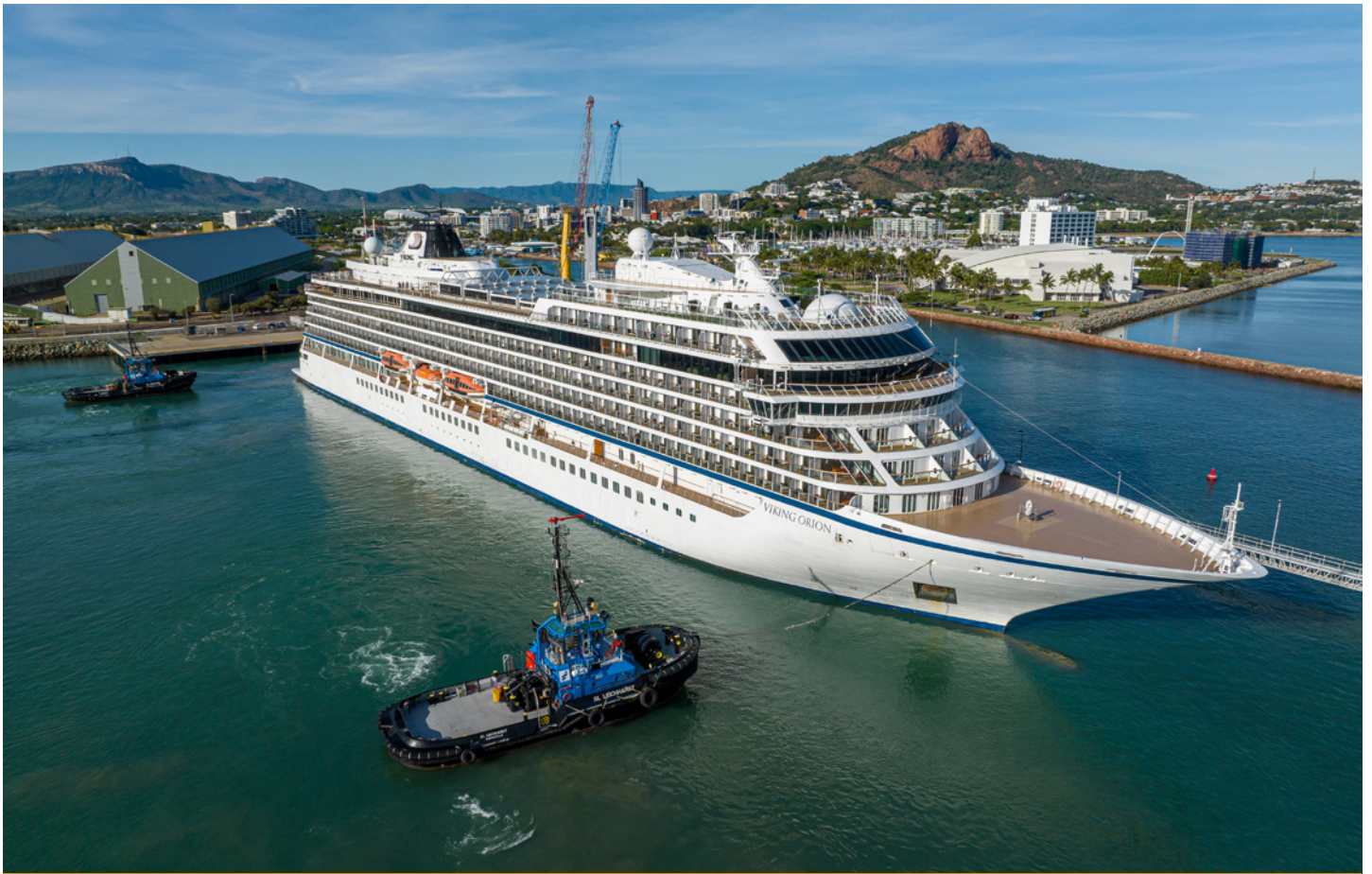
Port of Townsville