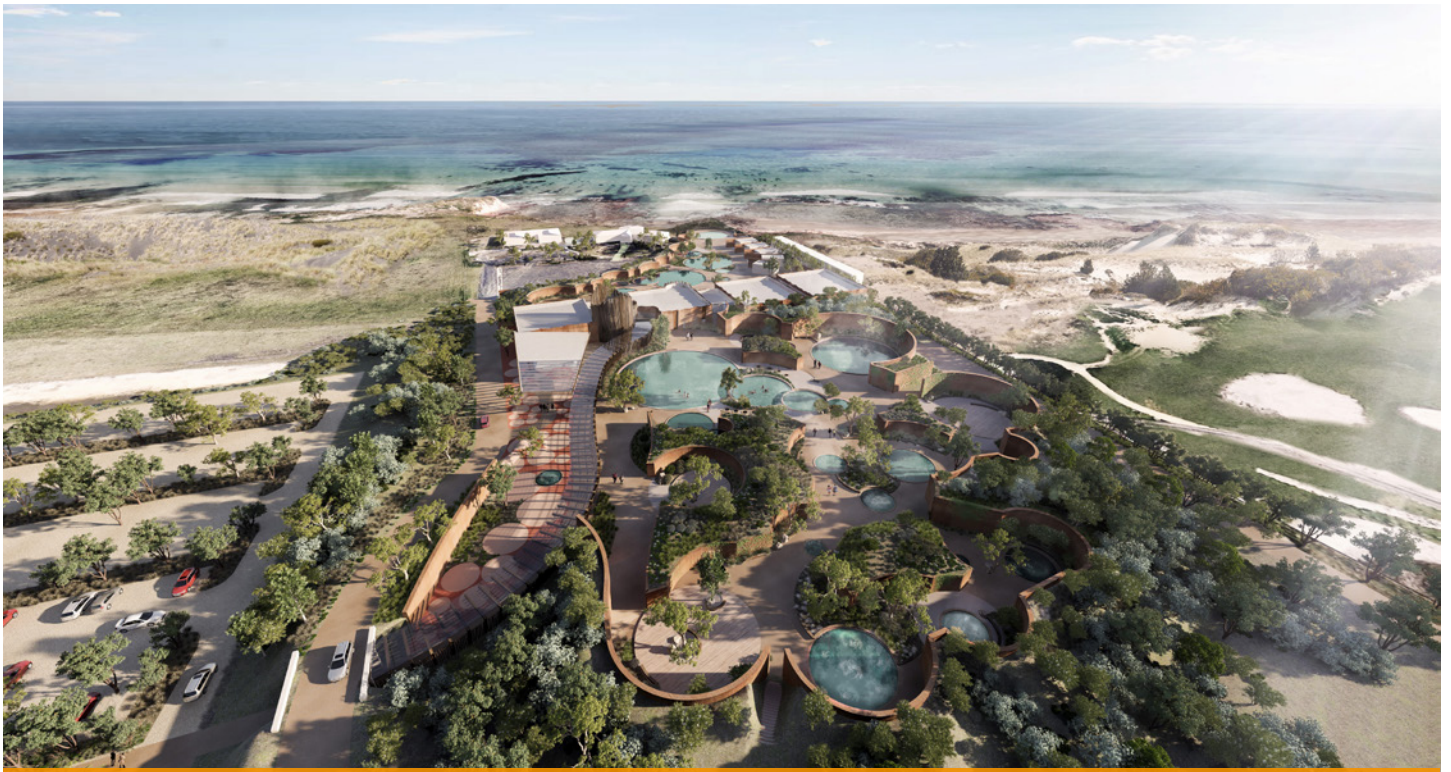
Phillip Island Hot Springs