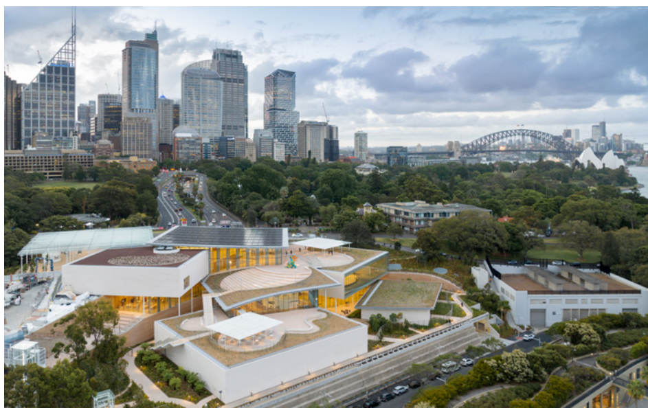
Art Gallery of NSW

An Indigenous lens is held up across the displays as they powerfully herald new art histories to be written and shared. The Art Gallery's curatorial narratives are amplified through networks connecting the urgent social issues that motivate artists in the 21st century, including gender, race, the value of labour, and a strong concern for the precariousness of the natural world.